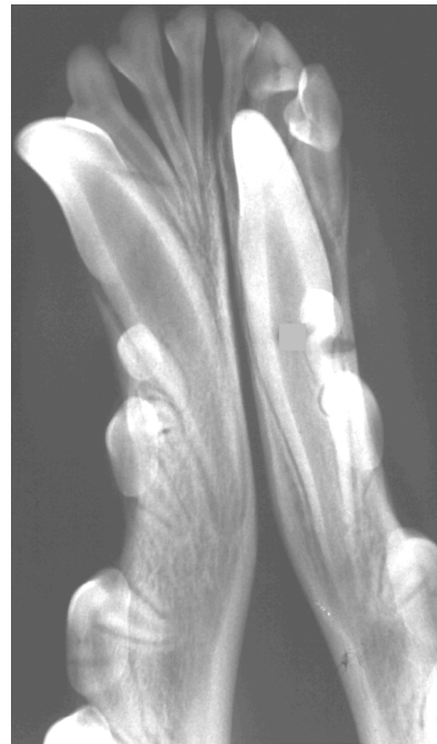
Figure 5: Radiograph of the rostral mandible of a young sheltie with a misplaced right canine tooth.

My theory on the mandibular canine is as follows. When the tooth was developing, its tip was pointing rostrally instead of dorsally. As the tooth grew, the crown "erupted" rostrally within the mandibular bone until it struck the roots of the incisors. At this point, the crown could not go forward, so as the tooth got longer, the apex of the root had to move backward. Notice that the apex of the left canine is below the second premolar (where it belongs) but the apex of the right canine is below the third premolar.