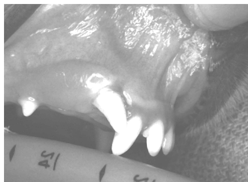
Figure 2: An affected dog with the right maxillary canine directed mesially and blocking the diastema.

In affected shelties, one or both of the maxillary canines is malpositioned so that it is lying more horizontally. As such, the crown crosses the diastema and blocks the mandibular canine out as in Figure 2. Now on closure, the mandibular canine contacts the maxillary canine and is often forced to tip labially. Owners notice this because the mandibular canine then starts to catch on the upper lip.