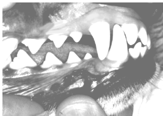
Figure 1: The normal canine triad.

To understand a problem, you must first understand normal so I will review the normal relationship of the canine triad . The canine triad is composed of the maxillary lateral incisor and the canine teeth on one side and is depicted in Figure 1. In this picture, you can see that the crowns of the canine teeth are basically vertical. There is a large space between the maxillary lateral incisor and the maxillary canine and this space is known as a diastema . When the mouth is closed, the mandibular canine crown resides in the centre of the diastema so that it does not contact either of the other teeth in the triad.